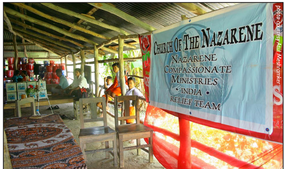
Local children linger with Nazarene Compassionate Ministries (NCM) workers and cyclone-relief supplies at the Child Development Center in Jota, India. Food, clean water and medicine have aided victims since Aila hit in May.