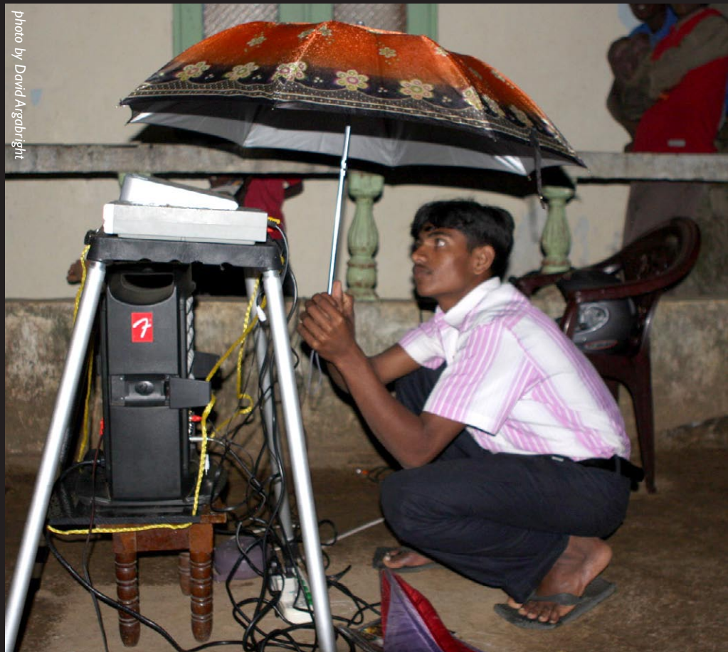
A JESUS Film team member protects the projector from evening rain during a screening in Bangladesh.