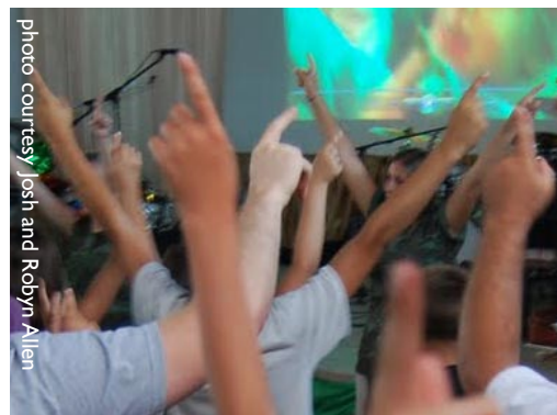
Campers in Millytopyl enjoy songs with hand motions during an evening service near the sea.

For videos of both camps, check out joshrobynruussia.blogspot.com