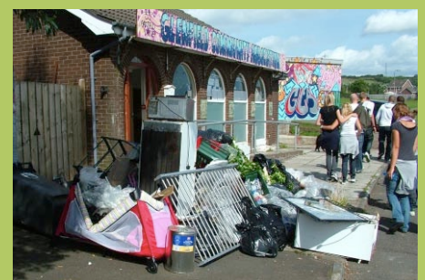
Piles of trash attest to a day of hard work as girls from Northern Ireland and the Netherlands head to their Saturday evening community barbecue.