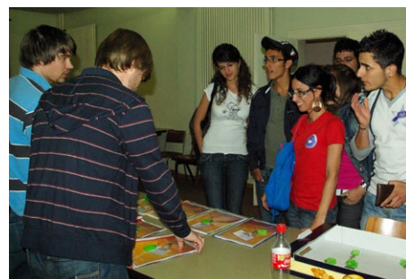
Delegates from Italy register in Büsingen, Germany.