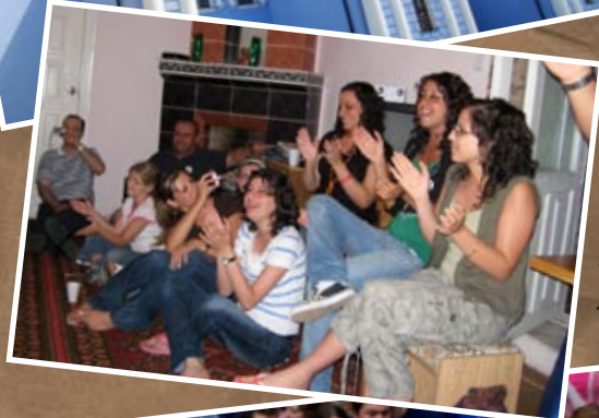
Eastern Med.: one big, late-night family group.