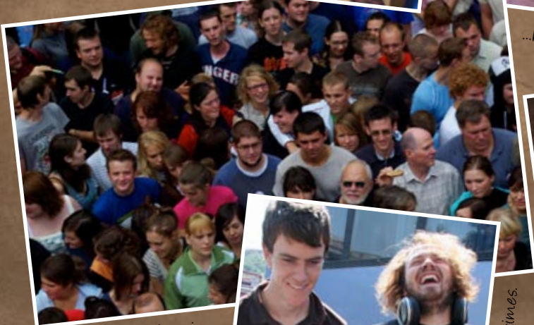
Group photo in the rain: chaos, misery, and some super-cool young people