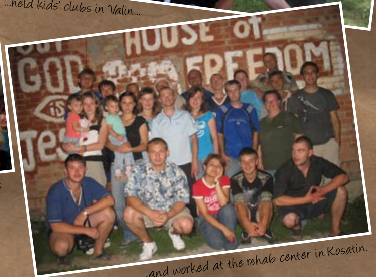
...and worked at the rehab center in Kosatin.