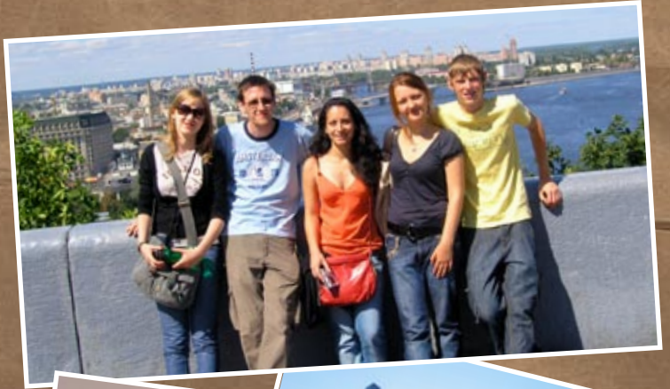
Russian and Dutch youth make friends on the day trip to Kiev (yeah!)