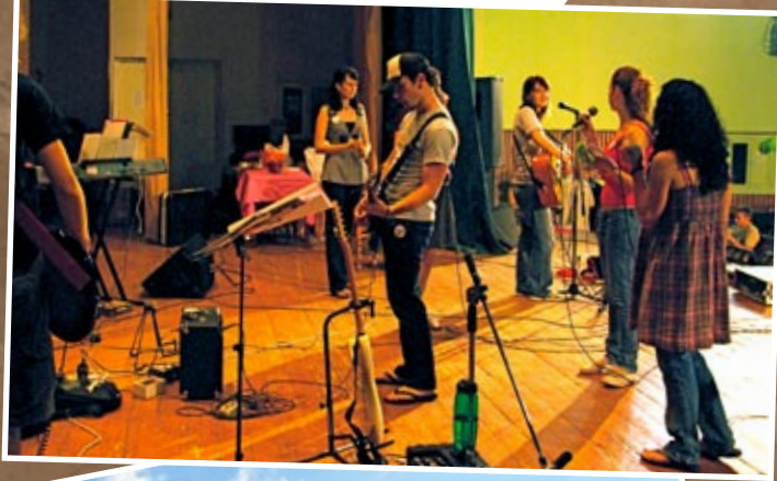
The NYC band: these guys can rock!