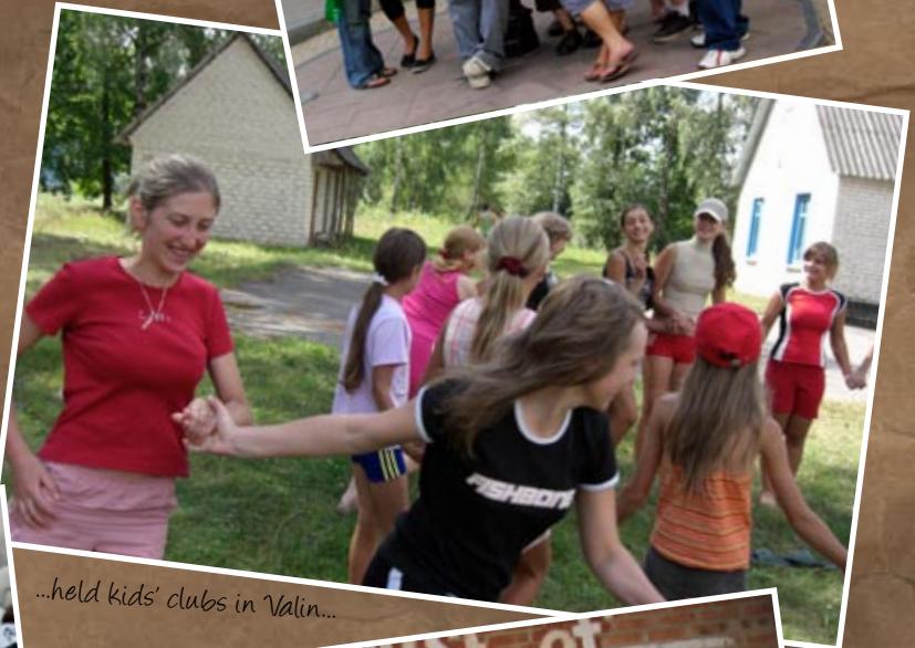
...held kids' clubs in Valin...