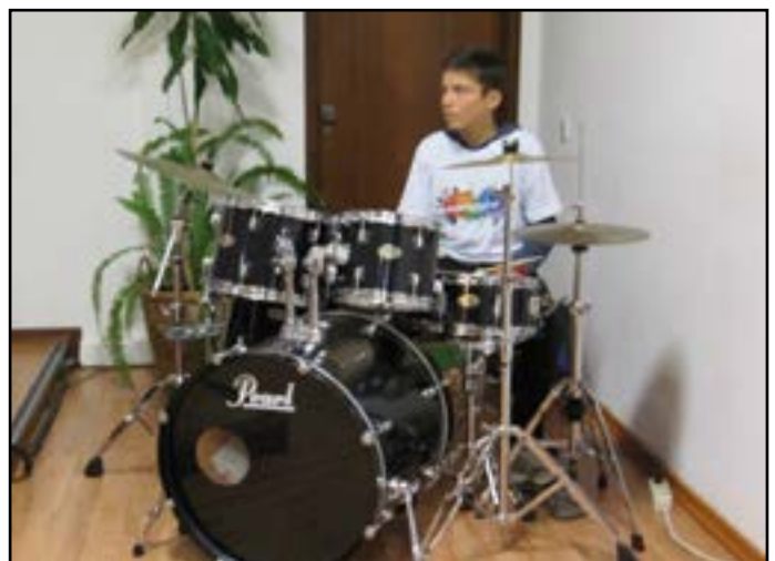
A music lesson student plays drums in the church's worship team and was recently baptized.