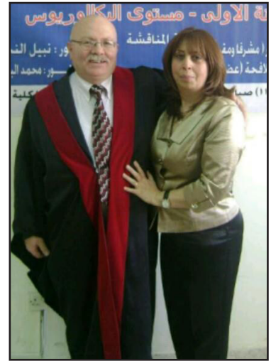
See "AWARD" • page 6