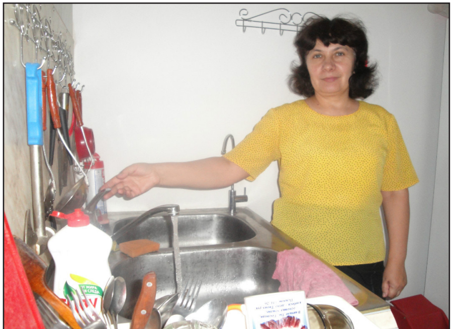
Prior to the new water line, children’s workers had to haul gallons and gallons of purchased pure water for the 50 to 60 children they cooked and cleaned for during the children’s camps.