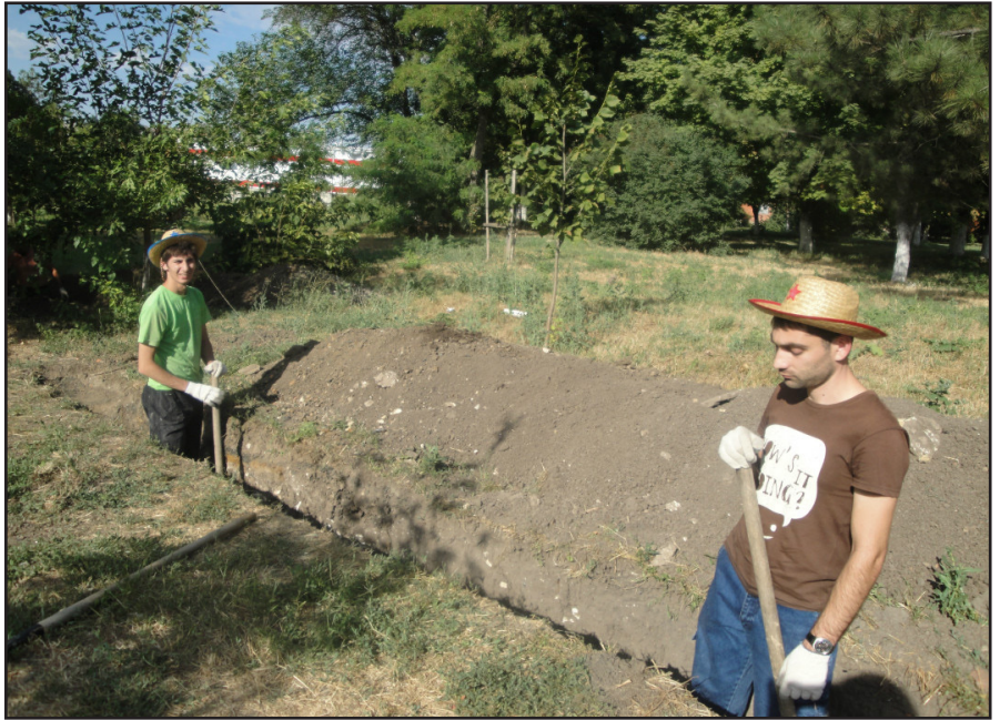
The Grace Church of the Nazarene lost its water supply when underground water levels dropped, so the church was forced to connect to the existing city water supply line in Chalter, Russia. NCM International and NCM CIS partnered to provide the funds needed to connect.

“Every summer we organize camps for children from church and for un- churchd children. We feed children three times per day during the camp. Plus we have refreshments and snacks during the day. Could you imagine how much water we had to bring in every day to cook for and clean after 50-60 children?” said another children’s leader. “It was very challenging for us. But this year ... we won’t have a problem with running water, because now we are connected to the fresh water supply line. And we also have water filters, so that our children can drink clean water.” ▼