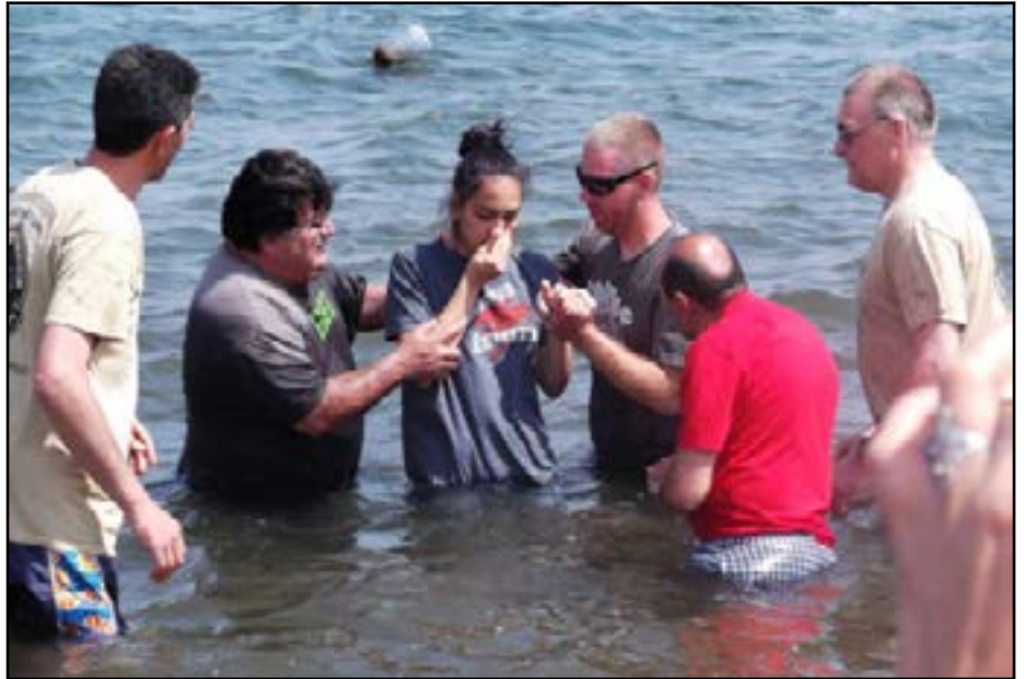
Nine people were baptized at the Armenia teen and children's camps where many youth experienced significant change in their lives and attitudes.

Kids are becoming leaders in these ministries, and many are planning to attend future camps. The effects of camp are even allowing an openness of parents to send their children to Kids Clubs, which occur throughout the year, allowing for more ministry and discipleship exposure.