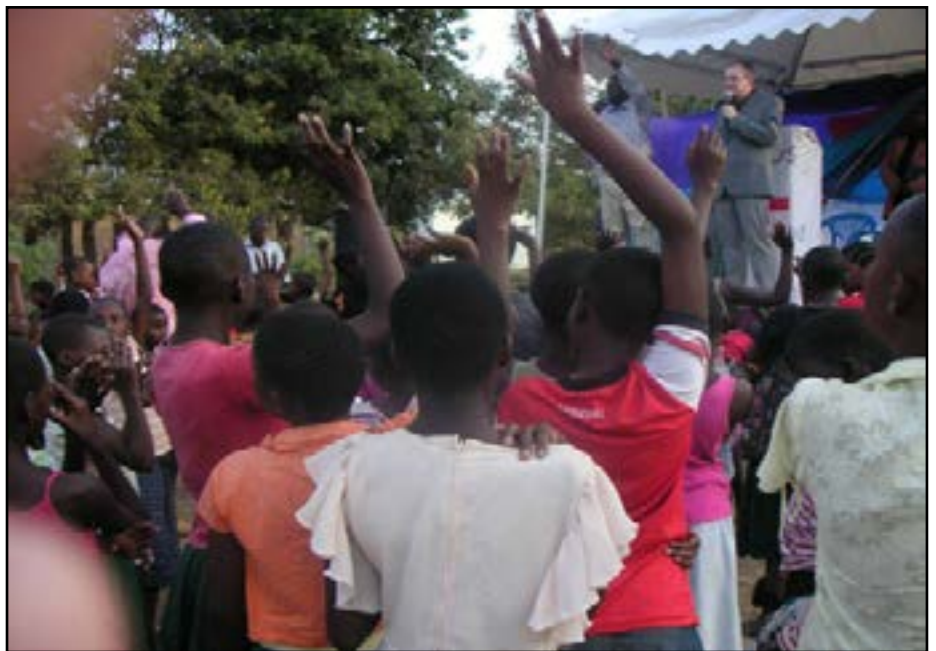
The British Isles South District youth mission team held an evangelistic campaign in Mwanza, Tanzania, in July, followed by a leadership conference and workshops on AIDS prevention and understanding.