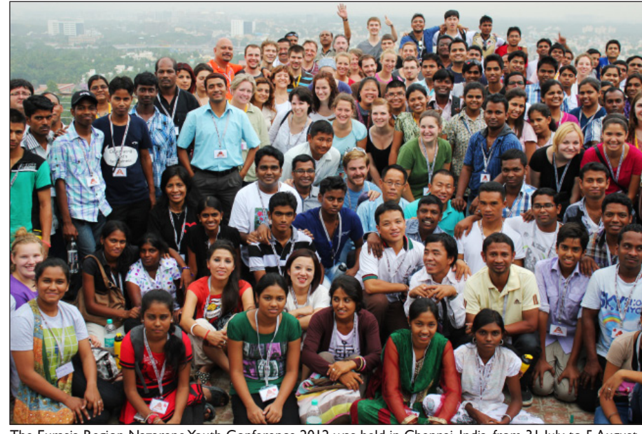
The Eurasia Region Nazarene Youth Conference 2012 was held in Chennai, India, from 31 July to 5 August. The theme of the event was to find out what it means to be Christ-like in such a mix of cultures and perspectives. Photo courtesy Laine Burdick .