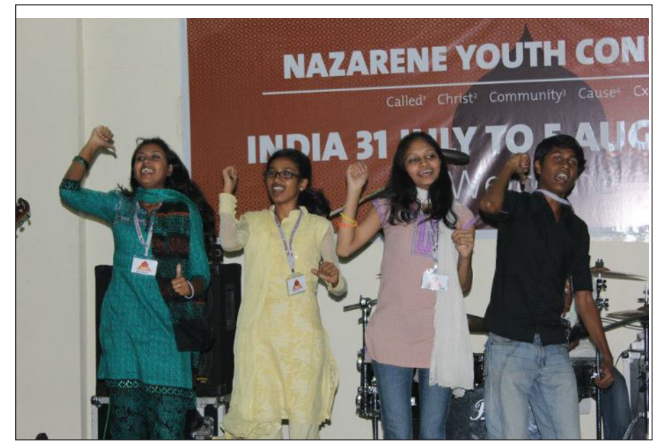
The participants at Nazarene Youth Conference (NYC) in Chennai, India, were divided into country groups and asked to discuss issues of slavery particular to their countries and how they could be agents of change.

"Through this we hope that Eurasia youth would be made aware about the modern slavery and how it breaks the heart of God, who actually wants humans to live in harmony and not in oppression and exploitation; all the